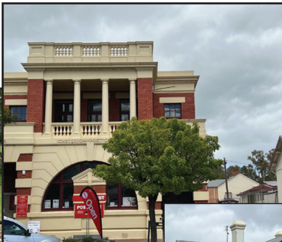
▲ Post Office 1910