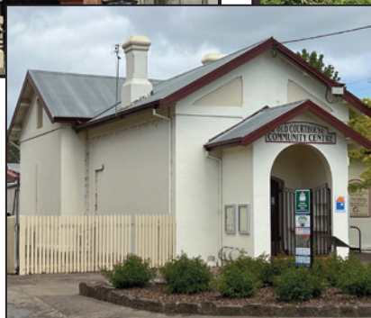
▲ Old Courthouse opened 1875