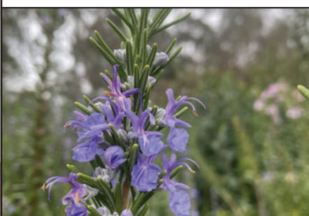
▲ Rosemary sprig ◀ Lady Sue Ryder