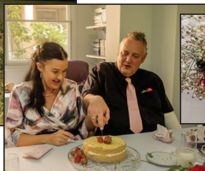
▲ Rings and roses ▲ Cutting the wedding cake